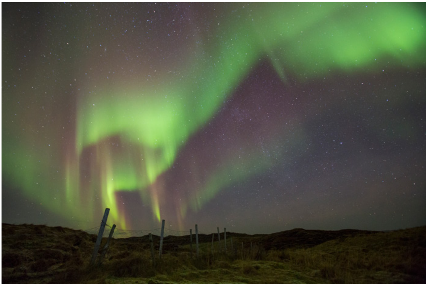
Northern lights. The island "Musvær" not far from "Kvaløya", Tromsø.