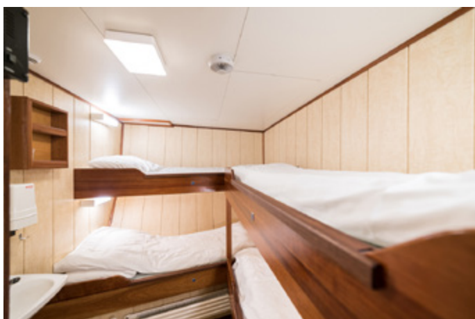
Sleeping saloon. Four berths.