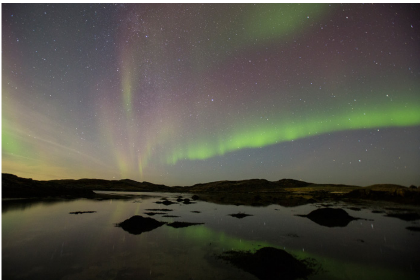
Northern lights. Tromsø.