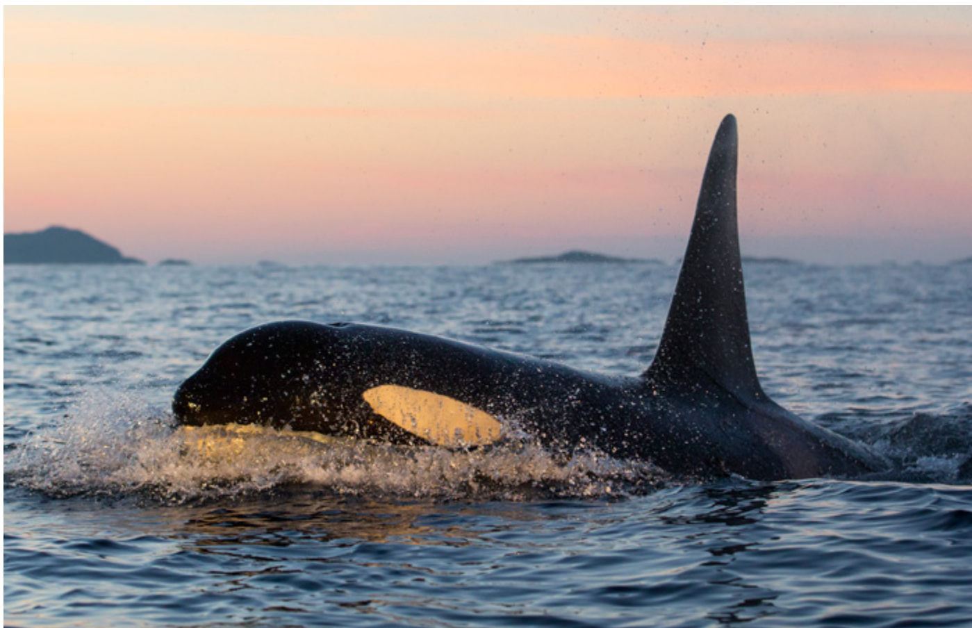
Killer Whale following the boat. Photographed with a fill flash with red filter.