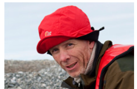
Travel with norwegian photographer Svein Wik

In the evenings we try to find places anchoring or in a harbour where we can see the Aurora Borealis and photograph it in the surrounding landscapes. Inside a warm ship, maybe listening to the whales diving nearby, we can rest and be ready for next morning when following the whales again. The crew will have contact by radio with the nearby fishing boats and they will give us information about where to find the whales next morning.