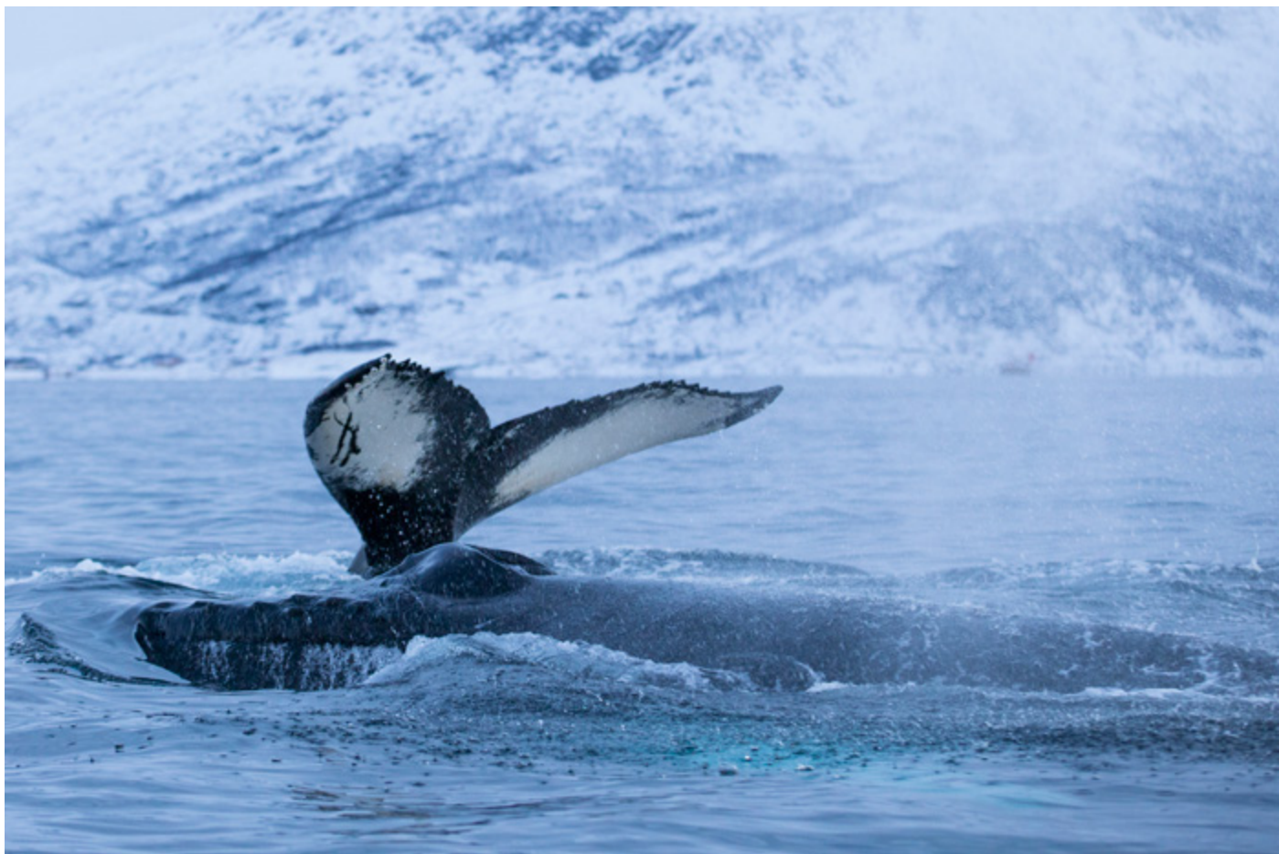
Humpback Whales close to the boat. Snow covered mountains in the background.