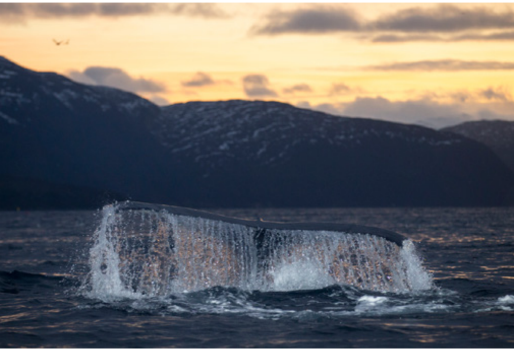
Humpback Whale and sunrise.