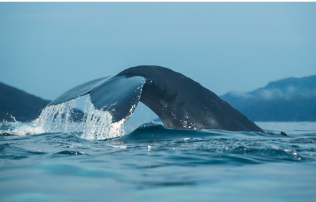
Humpback Whale from low angle photography.