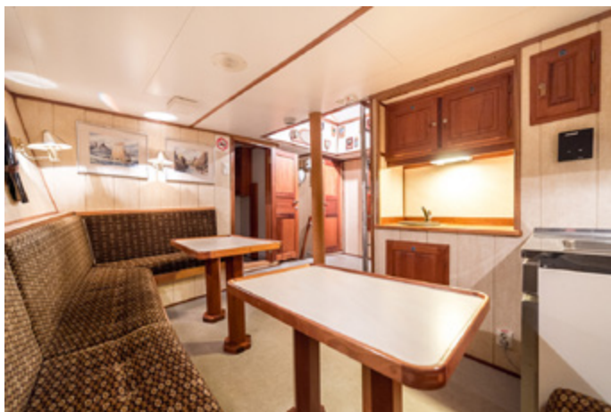
Aft saloon and bar.