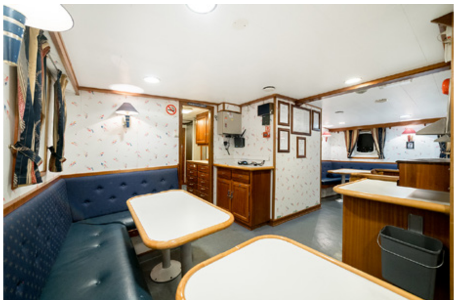
Main saloon for dining.

passengers in outside cabins, with upper and lower berth. She provides comfortable accommodation for 16 passengers, two guides and up to six crew. The owner and crew of the ship have long experience and are dedicated for the preservation of the unique nature and wildlife that the nature here in this part of the world offers.